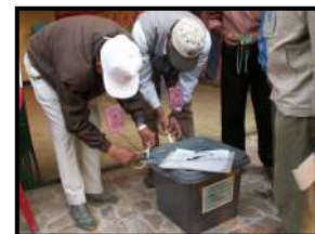
Ballot Box being Sealed