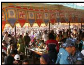
Voters lined up at 0645