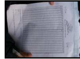
Recording sheet of gender segregated vote casted