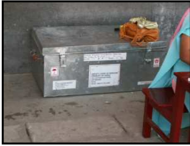
Electronic Voting Machines Packing shows that it is supplied by India