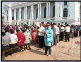
Voters & Onlookers

citizens and illiterates. Few voters also came out without pressing the button in desired way which resulted in non casting of their vote. Majority of people turned out to vote early in the morning to avoid any security incident later in the day, which leads to almost 60-70% voting complete by afternoon. Voters' line was dwindling to non existent post 1500. However people generally kept the periphery of polling station crowded to which they replied that its special occasion and we do not want to miss what's going on. It had equal number of men and women around polling station from start till end especially in urban centers.