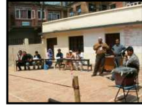
Open to Sky Polling Station