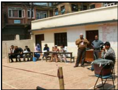
Polling Staff waiting for voters in the afternoon