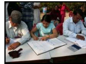
Polling Staff Entering Details of Voters for Electronic Voting