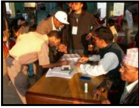
Polling Agents Registering at Polling Station

citizens and illiterates. Few voters also came out without pressing the button in desired way which resulted in non casting of their vote. Majority of people turned out to vote early in the morning to avoid any security incident later in the day, which leads to almost 60-70% voting complete by afternoon. Voters' line was dwindling to non existent post 1500. However people generally kept the periphery of polling station crowded to which they replied that its special occasion and we do not want to miss what's going on. It had equal number of men and women around polling station from start till end especially in urban centers.