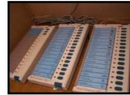
Electronic Ballot Paper