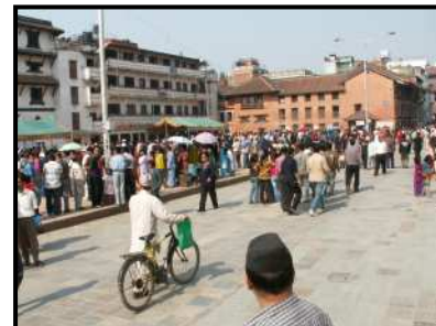
People walking to the Polling Station