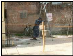
A Security Guard Resting Inside a Polling Station

The polling station security was lax and regular police was supported by the temporary security persons who were hired for a period of 3 month (getting a remuneration of Nepali Rs.10,000 for 3 months). In urban centers they remained as a show piece because people were largely organized and peaceful, however in rural areas their strength and presence at places were felt to be inadequate.