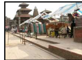
Polling Station Outside Temples