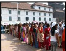
Women Waiting to Cast Vote under Open Sky

of the polling stations. Women's commitment to vote can be gauged from the incidence in Daud VDC of Doti, a women delivered her baby in queue waiting for her turn to vote after walking for one and half hour to reach polling station.