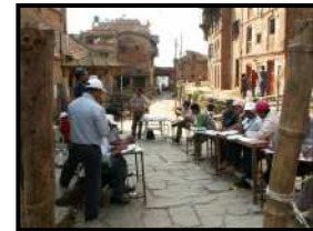
Polling Station in Middle of a Street