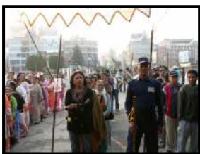
Provisional Security Guard at a Polling Station

The trouble spots where polling was suspended were Dailekh, Baglung, Arghakhanchi, Nawalparasi, Chitwan, Nuwakot, Sarlahi, Mahottari, Siraha, Saptari and Sunsari. These elections were held amidst threats from six dozen armed groups operating in Tarai. They vowed to disrupt polling and attack voters. The Election Day violence was relatively less as the disrupted polling stations were only 0.15%.