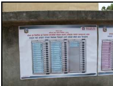
Information Poster for Electronic Ballot Papers