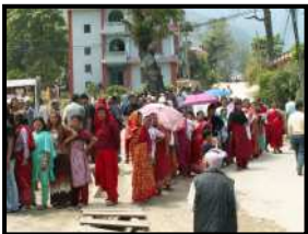
Women Waiting to Vote at a Rural Polling Station

to reality. The PR system is on closed list basis where voter indicate the preference for a political party. This kept women more confused than men.