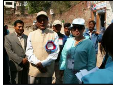
Observers talking to a candidate from Katmandu 1 Constituency