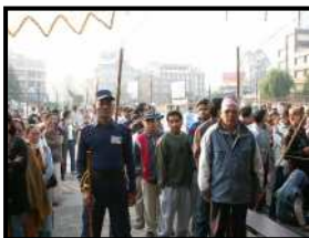
Men voters lined to cast votes

The voting time was from 0700 to 1700 without any break in 239 constituencies. Voters' response if recorded in one word, would be jubilant. Dressed in their best clothes, in Katmandu, voters were energetic and hopeful that this historic election will mark a new era for their country. Turn out was impressive for young to old and male to female alike. Voters were queuing at 0630 in their respective lines, for male and female, and patiently waiting for their turn. Average waiting time in the morning half, i.e. 0700-1300, was