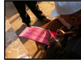
Polling Staff Signing Ballot Papers in Advance