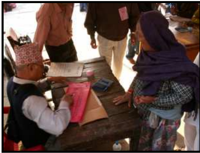
Ballot Paper being Issued