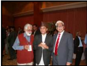
Chief Election Commissioner Nepal with Observers

The Election Commission of Nepal is established as an independent body responsible for organizing all elections and referenda in Nepal. The Chief Election Commissioner and four Commissioners were appointed in the second half of 2006 by the Prime Minister for a six-year period, upon recommendation of the Constitutional Council. The Election Commission decisions are implemented by an administrative structure of approximately 240,000 election officials working in all five regions, 75 districts and 240 constituencies. Significant technical assistance was provided by the United Nations Mission in Nepal (UNMIN) on a nationwide basis. The salient features of ECN as per constitution are in Annex 1