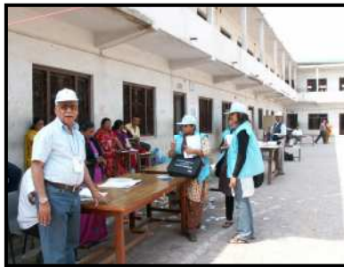
Observers taking information from Polling Staff