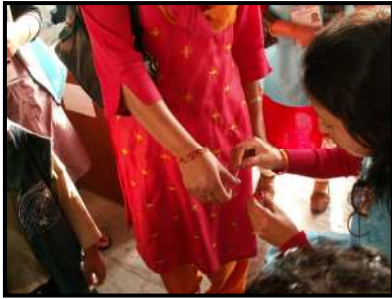
Indelible Ink being applied