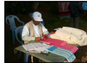
Ballot Paper being Signed in Bulk