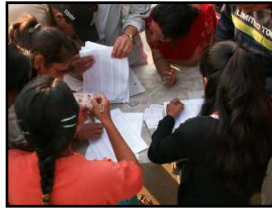
Voters Names being Checked in the Electoral Rolls