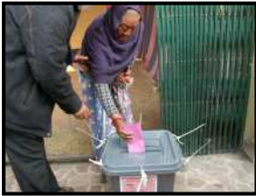
Old Women Casting her Vote at 0715

Women voter's mood if recorded in one word is festive. There was an air of festivity. It was lovely to see women dressed 90% in red – the color for festivity and/or holy occasions. Women and youth were out in queue since morning and patiently waiting. Women mostly illiterate but political aware which had conceptual clarity as to what would this election mean to them and country. Women appreciated the role of and participation of women in politics but for this election to them gender of a candidate remained a low priority as their focus was to have a political party which can translate their aspirations in