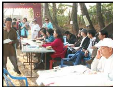
Polling Agents Seated at a Polling Station