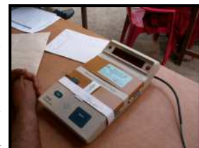
Electronic Ballot Registering Machine