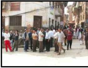
Youth outside a polling station in outskirts of Katmandu

Youth were also excited as for many it was their first election and even after casting their vote they were hanging around to observe the process and keep a watch if any one tried to disrupt the process. Voting age was 18. Around 1.5 million Nepali youth was reported to be out of the country for employment since the last elections, hence could not vote. Youth termed it once in a life time opportunity for them